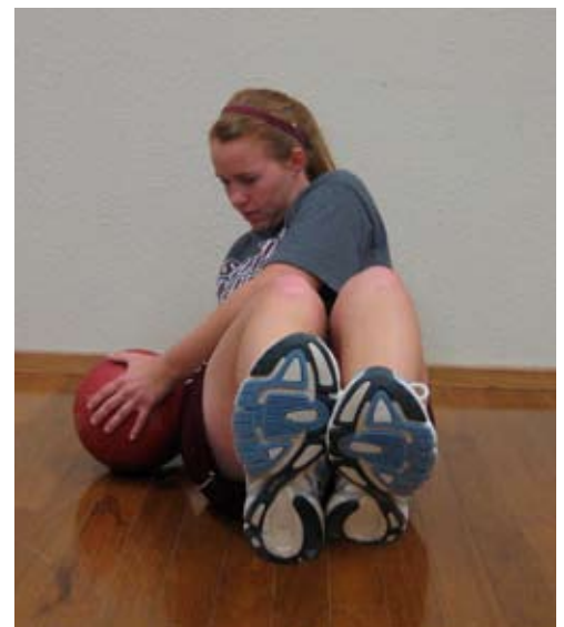
Fig8 Side Touch with Medicine Ball

Sit on the floor and lean back 45 degrees. Keep your feet off the floor. Move the medicine ball from side to side by twisting your trunk. Touch the medicine ball to the ground on each side. Repeat rapidly for 2 sets of 30.