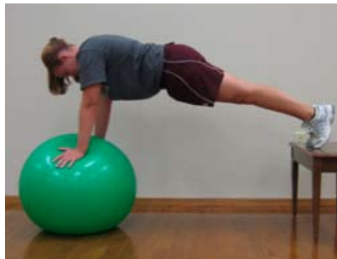
Fig12 Stability Ball Push Ups

Get in a push up position with hands on the ball and feet on the ground or on a box. Hold push up position by squeezing with the abdominals. Hold position for 45 seconds for 2 sets. Once you have mastered this exercise you can begin to actually do push ups on the ball.