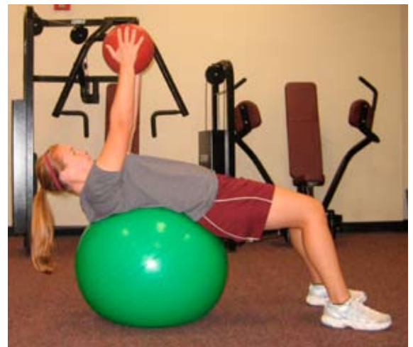
Fig2 Stability Ball Weighted Crunch