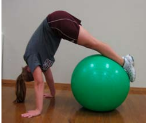
Fig9 Stability Ball V-Ups

Get in a push up like position with the ball below the thighs and knees. Pike the hips up as high as possible, keeping your legs straight. Lower back down controlled. Repeat for 2 sets of 15.