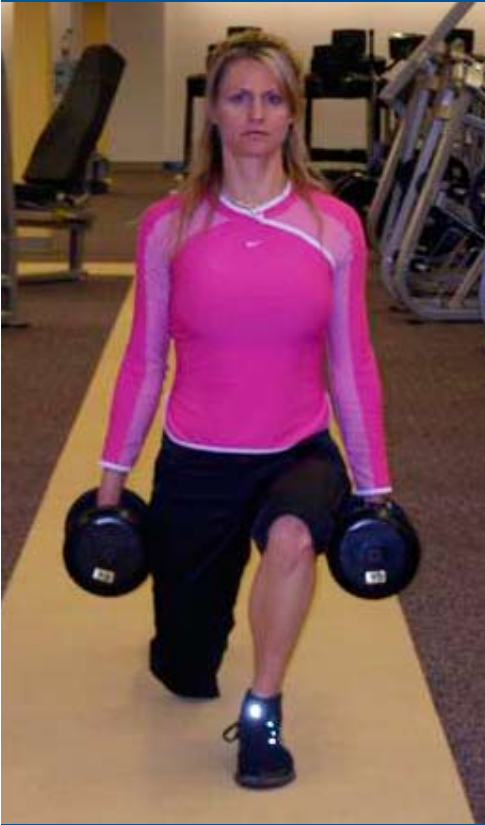
Fig3 Forward Lunge