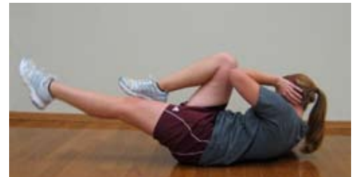
Fig7 Floor Bicycles

Lie down with your back flat on the floor. Arms should be bent at the elbows and placed with your finger tips by your ears. Legs are together and extended outward 45 degrees to the floor. Pull one leg into your chest by flexing your knee and keeping the other leg extended. At the same time, crunch up and diagonally bring the opposite elbow to the flexed knee. Alternate knees and elbows in a cycling manner. Repeat for 2 sets of 25.