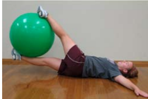
Fig5 Stability Ball Leg Rotations

Lie down with your back flat on the floor and arms extended out to your sides. Place the ball between your calves, squeezing with your legs to hold the ball in place. Rotate your legs and hips so that your feet are now above and below the ball. Rotate to both sides and repeat for 2 sets of 20.