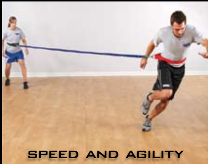
SPEED AND AGILITY