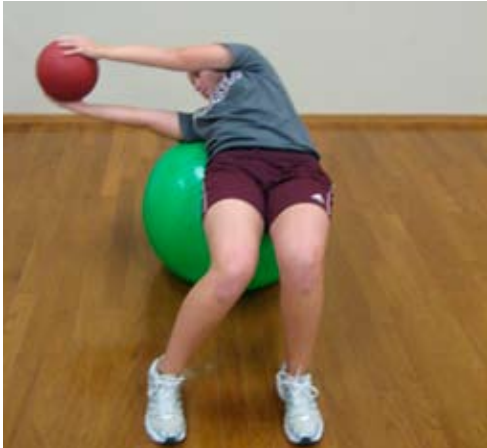
Fig3 Stability Ball Rotation

Lie with your back on the ball and feet flat on the ground. Knees bent at 90 degrees. Holding a light to medium size medicine ball in your hands, rotate to one side while keeping your feet in a stationary position. Allow the ball to rotate across your back while keeping your hips under you. Rotate to both sides and repeat for 2 of 10.