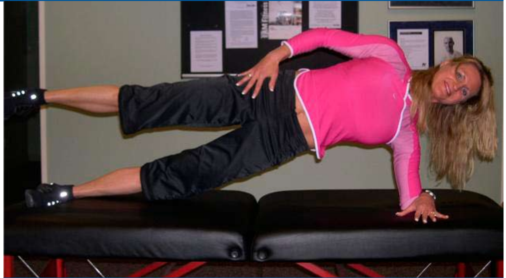
Fig5 Side Plank with Hip Abduction