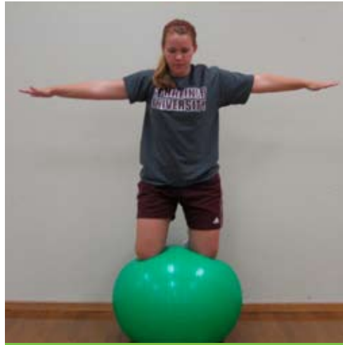
Fig11 Two Point Kneeling on Ball

Place both knees and hands on the ball. Slowly try to remove hands and balance with just your knees on the ball. This may take some time to master. Once balancing on the ball with knees hold for 45 seconds or as long as you can for 2 sets.