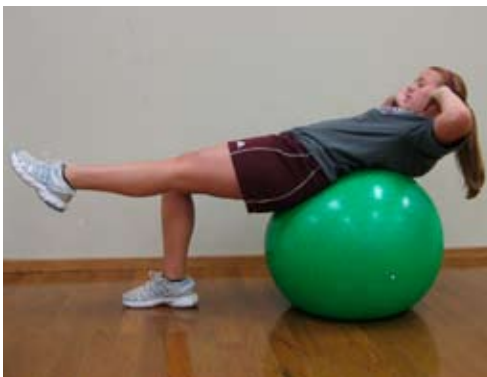
Fig4 Stability Ball One-leg Sit-up

Lie with your back on the ball. Have one foot on the ground with the knee bent at 90 degrees and the other leg extended out. Slowly curl your trunk, lifting your shoulder and upper back off the ball to a sitting position. Then slowly return to starting position. Repeat for 2 sets of 10 on each leg.