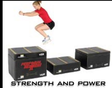
STRENGTH AND POWER