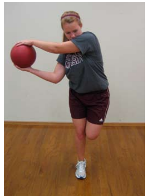
Fig14 Single Leg Medicine Ball Throw

Stand on one leg and hold the medicine ball with both hands. Bring the ball back by rotating backward. Rotate forward explosively and release the ball. Repeat on both sides for 2 sets of 10 (2).