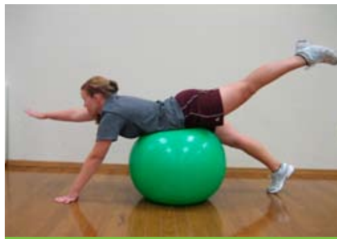
Fig6 Stability Ball Alternating Superman

Lie face down with your stomach on the ball. Feet should be shoulder width apart with your toes and palms touching the ground. Raise one leg and the opposite arm. Keep the arms and legs straight and reaching out. Hold for a few seconds and then switch to the other arm and leg. Repeat for 2 sets of 10.