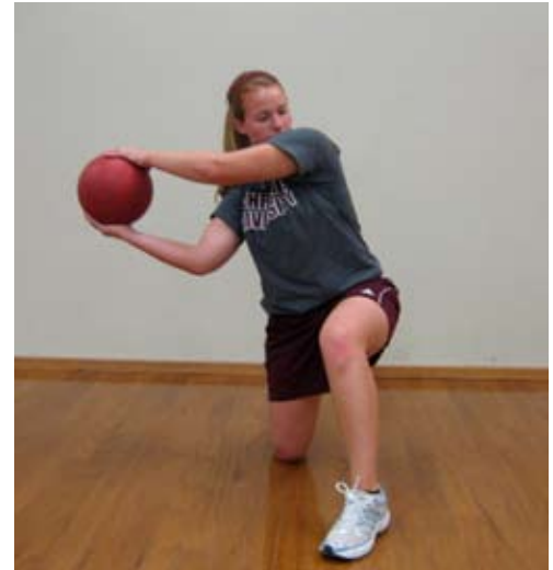
Fig13 Kneeling Medicine Ball Throw

Kneel on one leg and keep on the other foot on the ground at a 90 degree angle. Hold the ball with both hands and bring back as in a wind up. Accelerate the ball forward and throw the ball. Repeat on both sides for 2 sets of 10 (2).