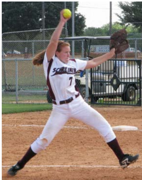
Fig1 Once the lead foot hits the ground the weight shifts and most of it is distributed to the front leg.

Lie with your back on the ball and feet flat on the ground. Knees bent at 90 degrees. Raise your arms toward the ceiling holding a weighted medicine ball. Have a posterior pelvic tilt during the exercise. Slowly curl up from a hyper-extended position and push the ball backward so that your buttocks are on the ball. Repeat for 2 sets of 10.