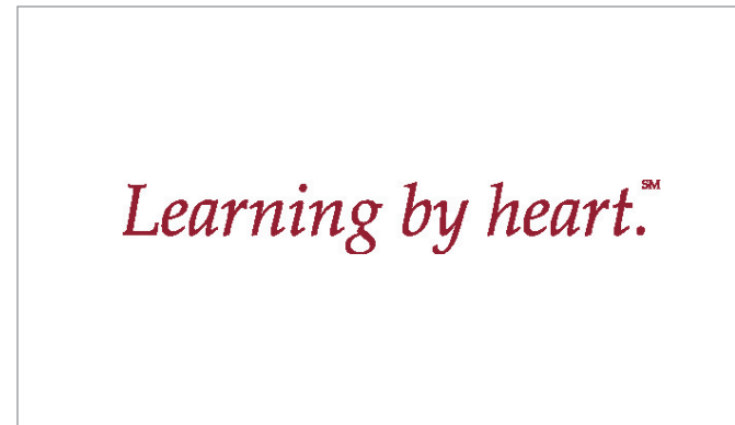
business card back

The official identity package should be used by all university staff and faculty on business cards and stationery.