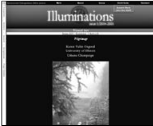
Illuminating the world through art and literature